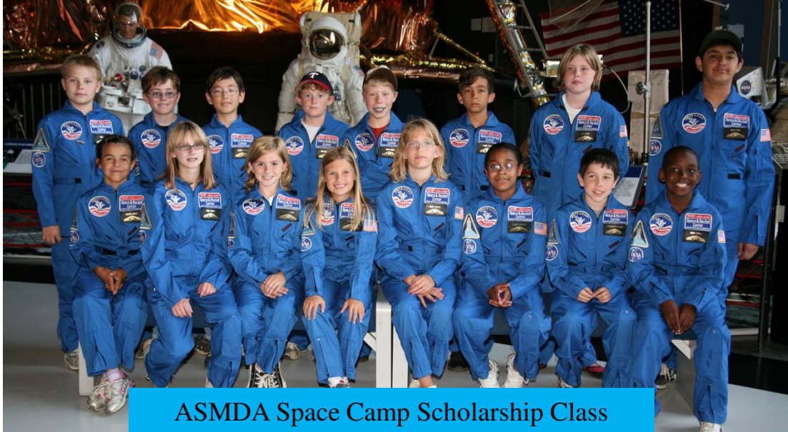
ASMDA Space Camp Scholarship Class

When: Sunday, 3 July 2016 – Friday, 8 July 2016