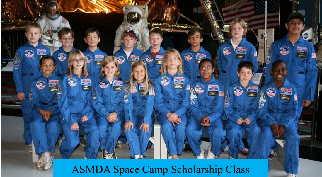
ASMDA Space Camp Scholarship Class

When: Sunday, 1 July 2018 – Friday, 6 July 2018